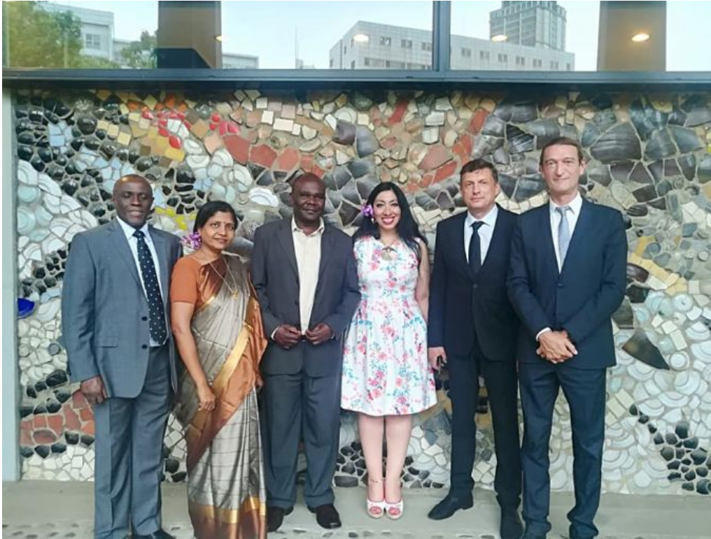
32nd Executive board meeting in Seoul, South-Korea

Our director has participated in Unitaid 32nd Executive Board Meeting and Communities Delegation pre-meetings, in June 2019. One of the activities of the communities delegation is to vote for how funding of large donors is divided between several health issues. As representative of the TB community in India, our director uses her position to push for TB funding for Asian countries.