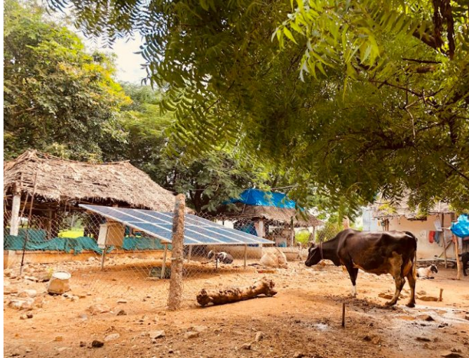
Solar panels at the farm