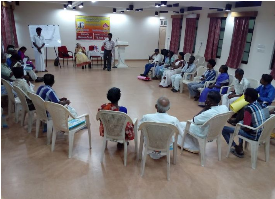
Rainbow TB Forum advocacy meeting

Since her inception in 1993, Blossom Trust has been empowering women and TB patients, leading to diverse community based organisations (CBOs) who are now largely independently running, but still overseen by Blossom Trust.