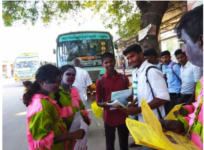
Handing out fliers with TB information on the street

1. Rainbow TB Forum received funding from Cepheid for a two days TB awareness raising event in the weekend of World TB Day 2019. Rainbow TB Forum, together with Blossom Trust, shared the stories of TB survivors across Virudhunagar, raised awareness about TB symptoms by handing out fliers with a TB disease profile, and collected 1,629 signatures for a government petition to include TB rights on political candidates' platforms.